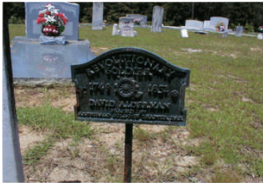
BRANNEA CEMETERY 5 Miles west of STATESBORO